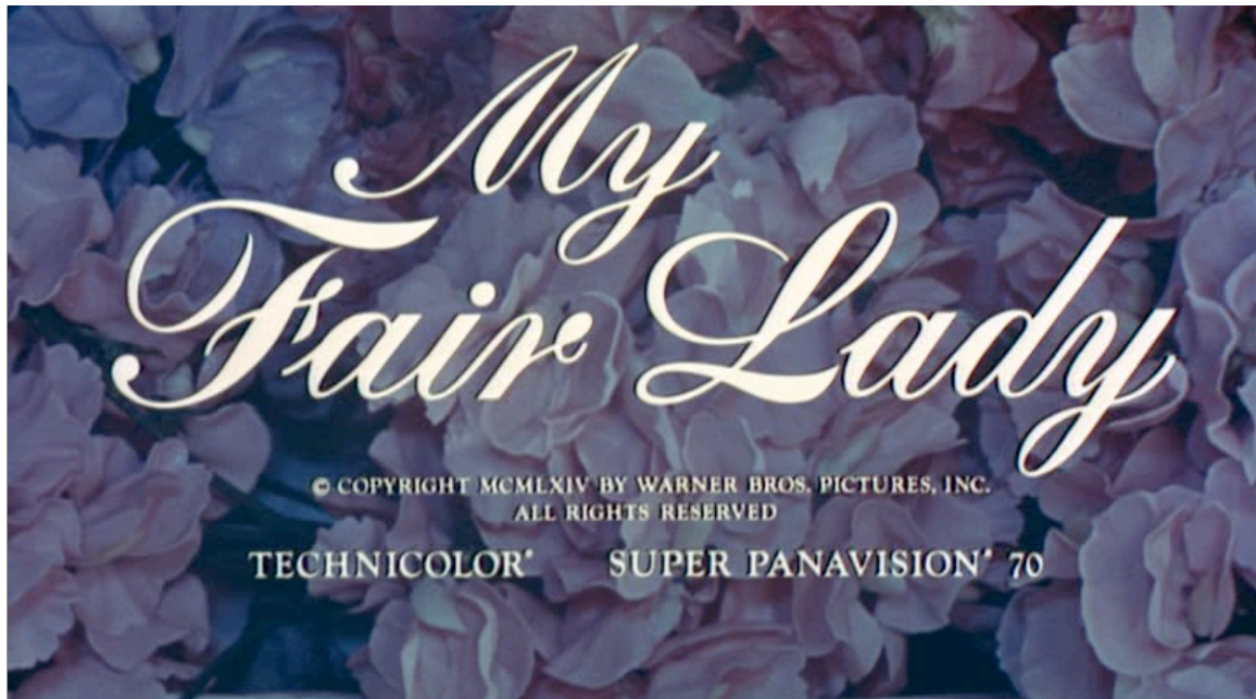
Figure 4: My Fair Lady (1964)