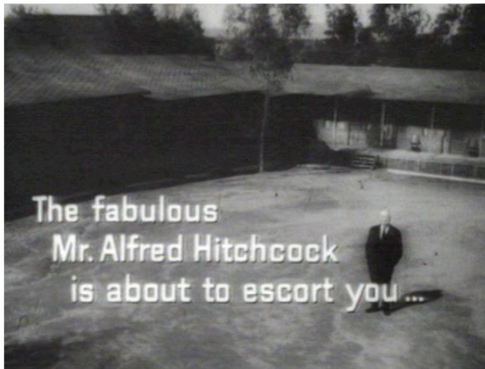
Figure 10: Beginning of the trailer for Psycho (1960)