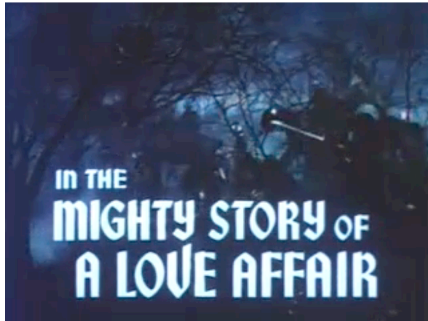
Figure 1: The Private Live of Elizabeth and Essex (1939)

In addition to these text graphics, there is the standard print information and title card, which includes the movie's title, cast, director, studio, technological attributes such as Technicolor, Panavision, 3-D, et al. [Figure 4], and more recently, the movie's website address.