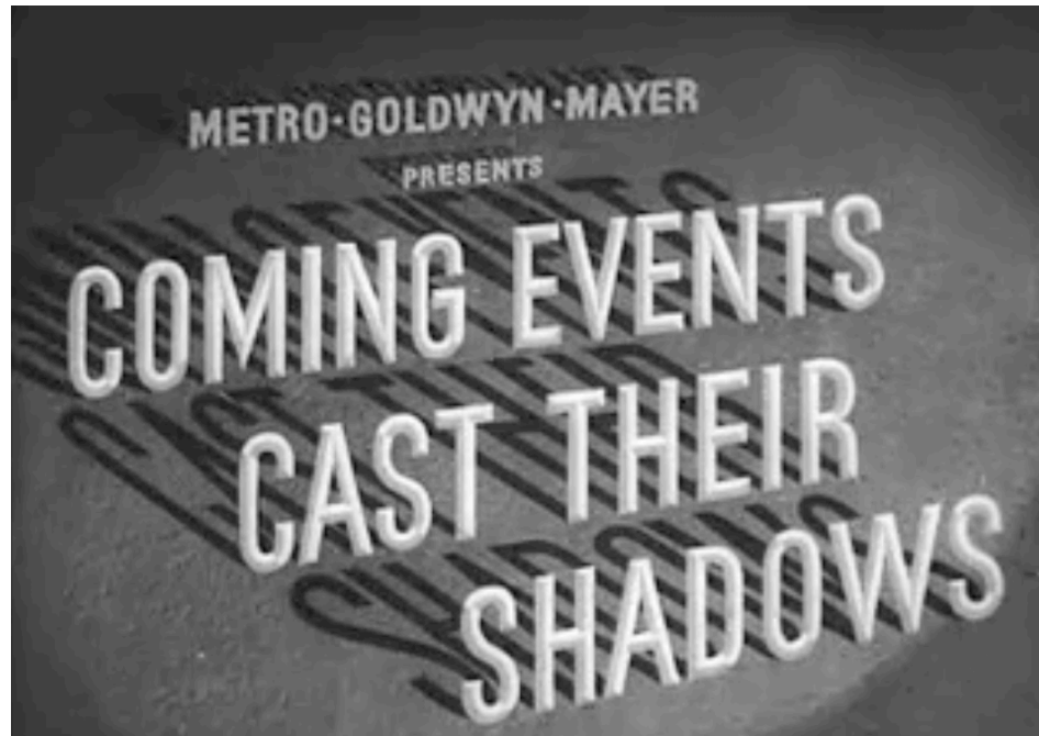
Figure 12: Title card for The Shop Around the Corner trailer