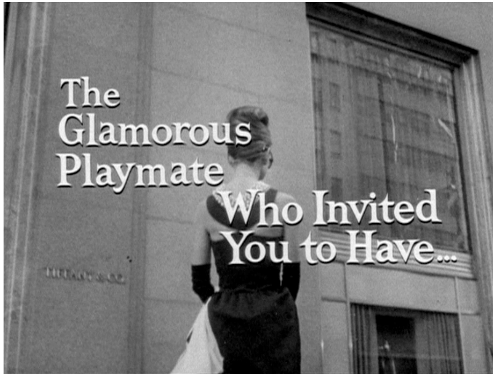
Figure 6: Image from Breakfast at Tiffany's (1961) in the 1962 re-release trailer for Roman Holiday (1953).