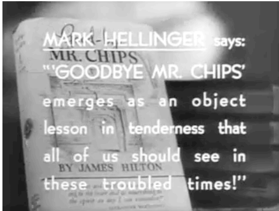
Figure 8: WWII reference in Goodbye Mr. Chips trailer

While there were many “special” trailers during this time period, there was also common set of traits, which were part of the standard NSS trailer format. During this period of the classical Hollywood era, the National Screen Service dominated the trailer-making scene and furthered the stereotypical formula present in the 1930s with the use of voice-over, scenes, and testimonies. After examining fifty trailers from this time period, there were several findings that seemed to be present in most of the trailers. Overall, the majority of the trailers were in black and white, which corresponded with the feature films. Color was only starting to be used, and therefore, trailers were featured in the same manner as their counterparts. For instance, the trailers for Gone With The Wind (1939) and Bambi (1942) were in color, whereas the trailers for Casablanca (1942) and Arsenic and Old Lace (1941) were in black and white. There was a heavy use of text graphics in trailers from this period, as well as heavy attention towards the film stars. Other observations include a prevalent use of “special trailers,” a longer average running