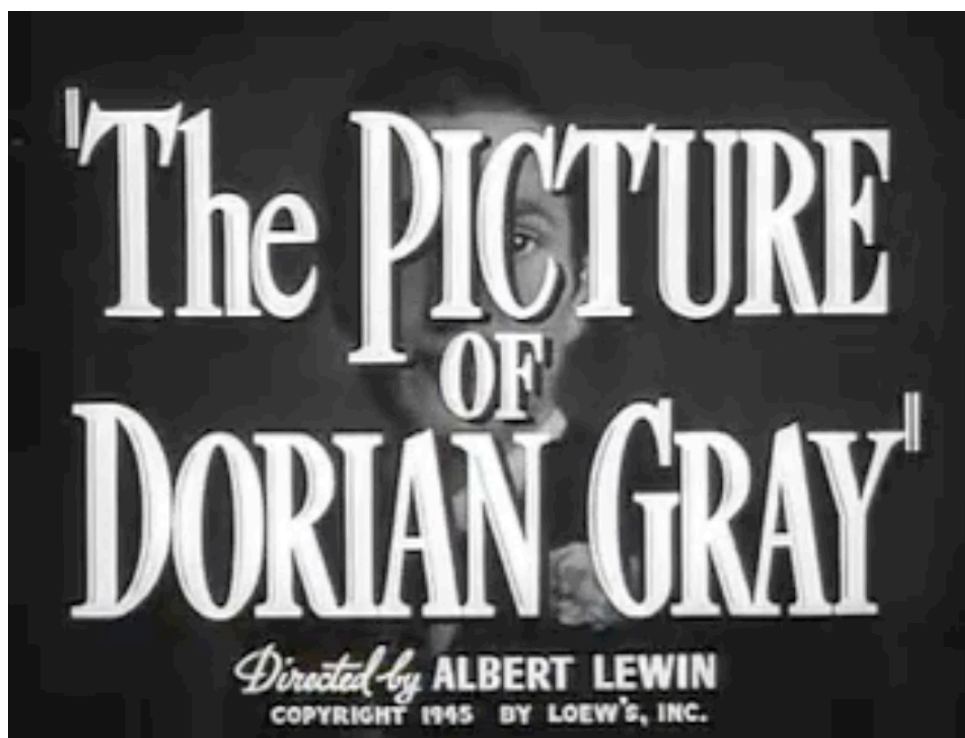
Figure 14: The Picture of Dorian Gray (1945) – Copyright Notice

The Academy Film Archive's processing and handling of the Packard Collection (previously the SabuCat Collection) is one of the current best set of practices for trailers. However, archives need to view trailers as significant artifacts beyond supplementary materials, as well as record metadata that is germane to trailers. Recommendations for important metadata that should be captured specifically for trailers, if available, includes: trailer house/company (or studio in-house department or National Screen Service), type of trailer (trailer, teaser, featurette, TV Spot) and version, creation date of trailer, approximate dates of screening, release date of feature film, provenance total running time, etc. [See Appendix A for more recommendations]. This information should be supplied in addition to condition assessment and information pertaining to the feature film being promoted in the trailer (i.e. studio, director, cast). Some of this information may be difficult to find or decipher, but it is important to gather as much