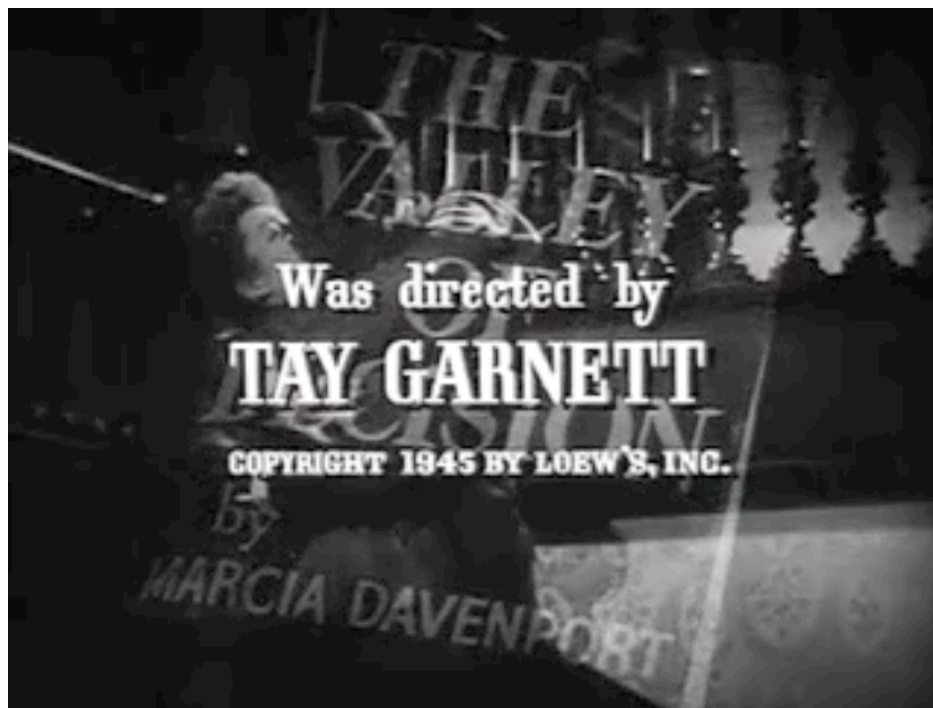
Figure 13: Valley of Decision (1945) – Copyright Notice

The previously stated issues may raise concerns with using trailers in some cases, although this does not completely limit the further use of trailers beyond research study. Some trailers do have copyright notices on them, for instance the trailers for Valley of Decision (1945) and The Picture of Dorian Gray (1945), which are both MGM pictures. They include the printed text "copyright by Loew's, Inc." which was the financier and parent company of MGM [Figures 13-14]. However, these are exceptions, and many of the earlier trailers do not have copyright notices on them. In regards to trailers, copyright is largely a case-by-case issue, and rather difficult to enforce an overall policy. While much more can be devoted to understanding copyright issues surrounding movie trailers, for the purpose of this thesis, copyright is an issue archivists should think about, but this concern should not hinder their decision to house trailer collections.