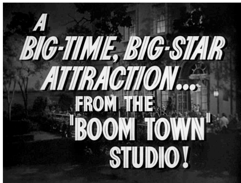
Figure 2: The Philadelphia Story (1941)