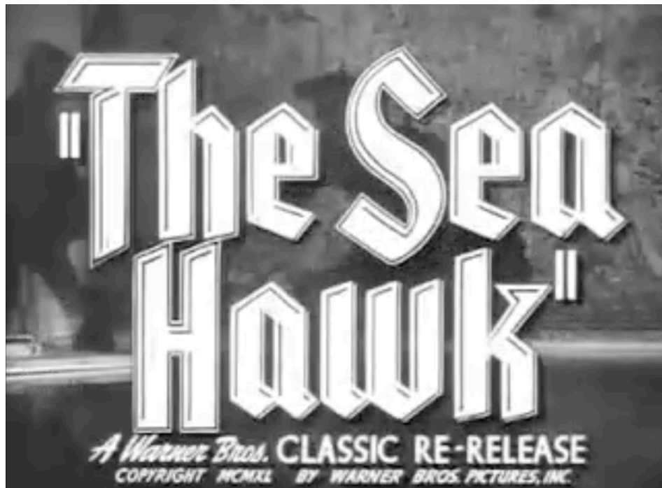
Figure 5: Re-Release of Sea Hawk (1940) in 1947

In addition to teasers, featurettes, and TV spots, there are also several versions of trailers. Often there are two or more different trailers released for a film, one prior to the film's release, and another later during the film's run. Aside from these domestic trailers, there are also trailers made for international audiences. There are also trailers for re-releases of films in the movie theaters, which was very common before television and in the early decades of TV when it was difficult to see a movie unless it was being shown at the movie theater. Some trailers for re-released films are similar to their original trailer and only mention it is a re-Released film or reprint at the end of the trailer [Figure 5]. However, other re-release trailers refer to the film's prior success or in the case of 1962 Re-release of Roman Holiday (1953), refers to Audrey Hepburn's enormous success the year before with Breakfast at Tiffany's (1961) and includes images from Breakfast at Tiffany's [Figure 6-7].