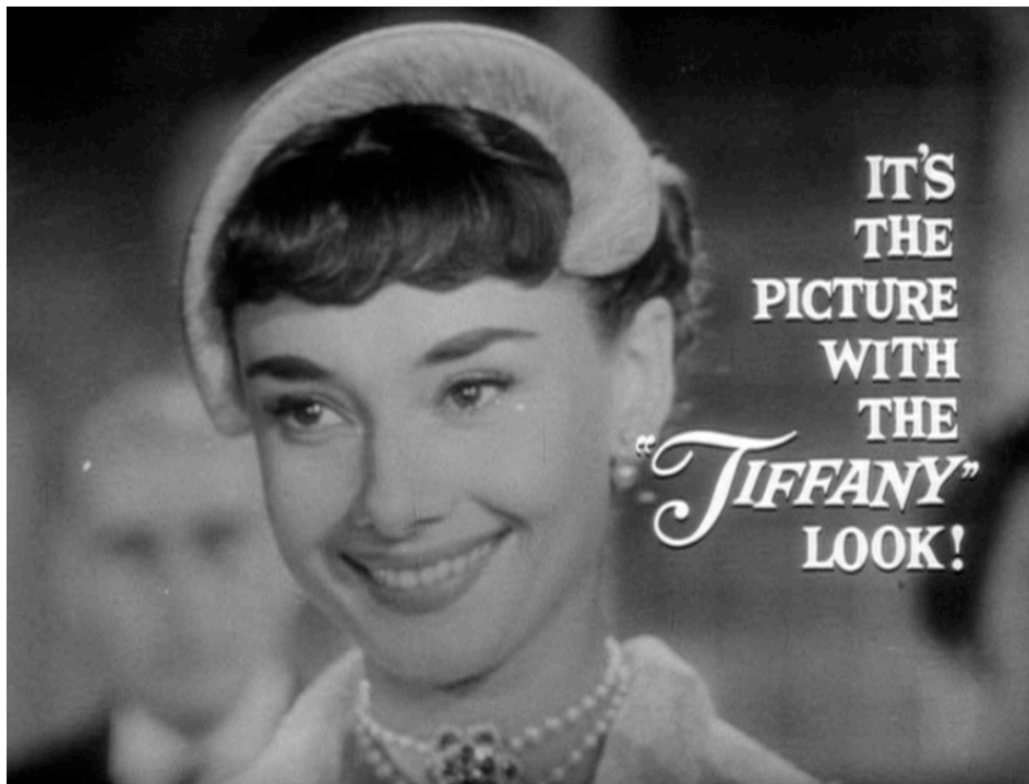
Figure 7: Text graphic alluding to Breakfast at Tiffany's to capitalize on Hepburn's previous success and draw in audiences for the 1962 re-release of Roman Holiday (1953)