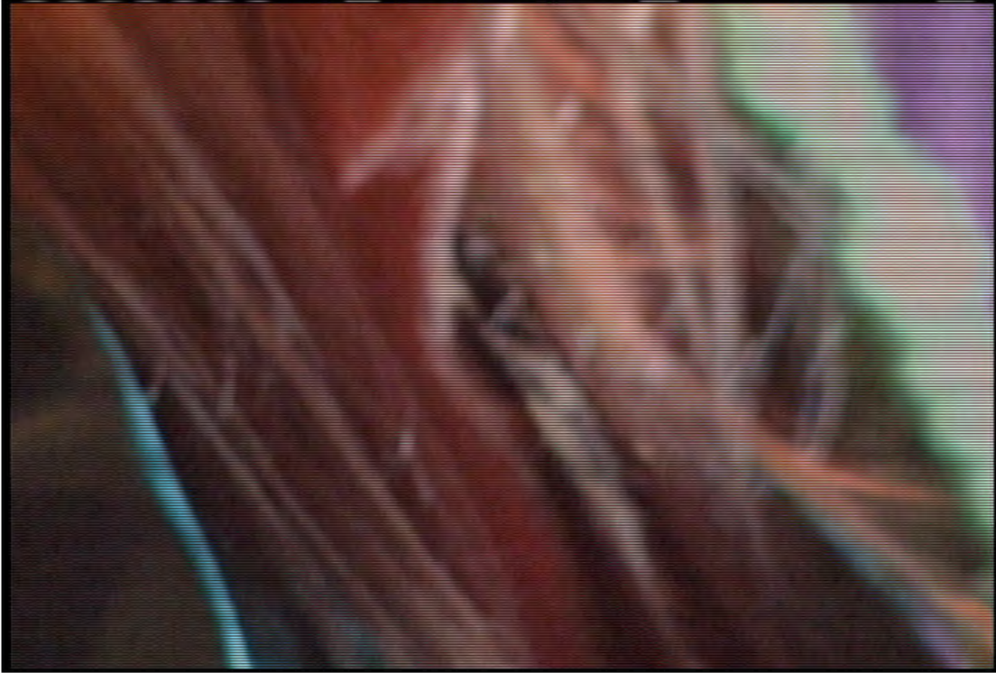
Figure 1 – Frame grab from Betacam SP Component Capture