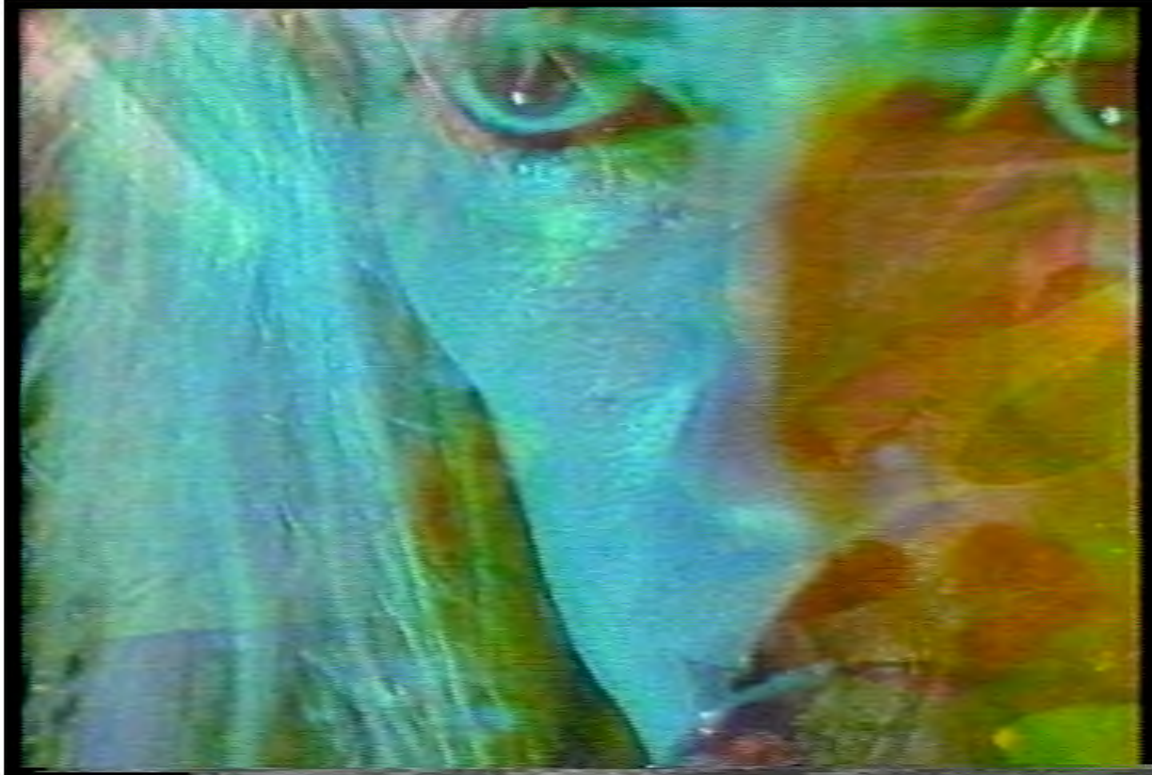
Figure 4 – Frame grab from U-matic composite clip