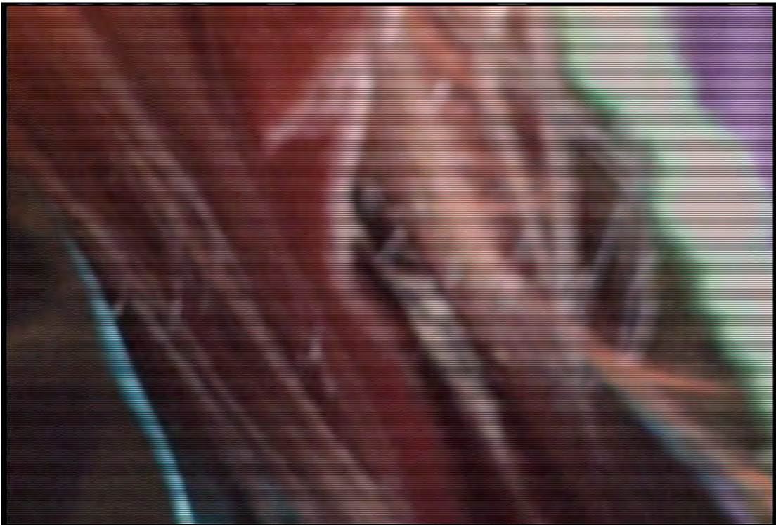
Figure 2 – Frame grab from Betacam SP S-Video Capture