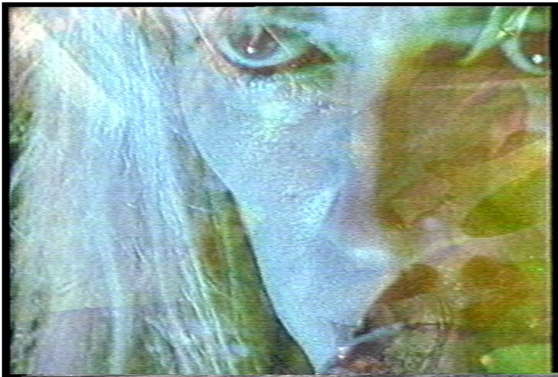
Figure 5 – Frame grab from U-matic s-video clip