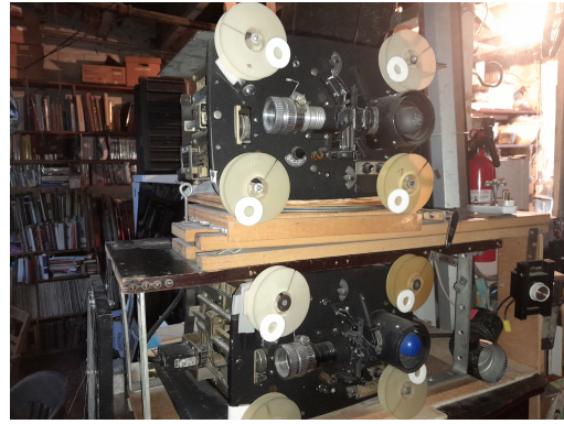
Figure II. Photographs of two PerceptoScopes at Ken Jacobs' house.

From this brief overview of four different models of analytical projectors, we have been able to see the different strategies used to allow for their slow-motion and still projection: