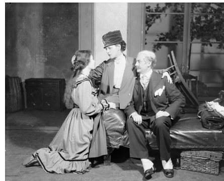
"The Cherry Orchard" at the Civic Repertory Theatre; L to R: Josephine Hutchinson (Anya), Alla Nazimova (Madame Ranevsky) and ?.