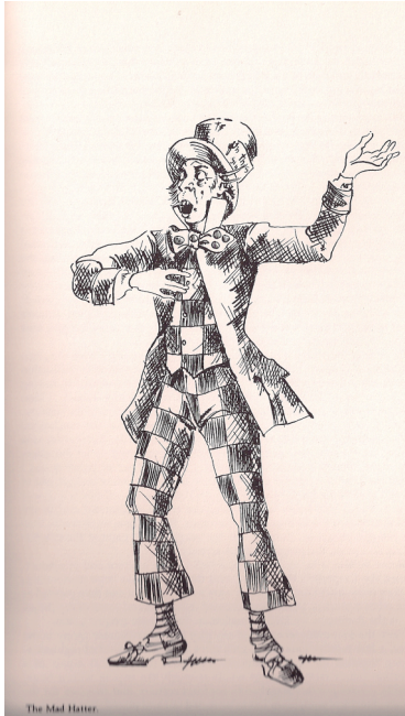
Sketch by Irene Sharaff, The Mad Hatter for “Alice in Wonderland,” 1932 Civic Repertory Theatre production.