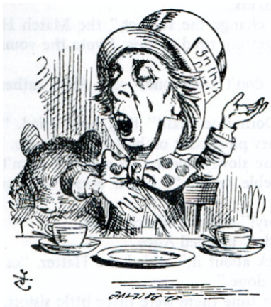
Illustration by John Tenniel, The Mad Hatter, Alice in Wonderland , by Lewis Carroll, 1865.