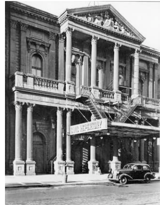
Civic Repertory Theatre, July 12, 1936