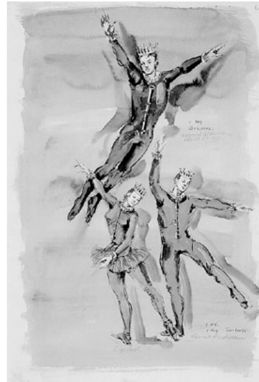
Irene Sharaff original costume design from "Fanfare," 1953, gouache. Harvard University collection.